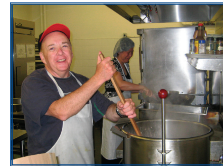
Kitchen volunteer preparing lunch.

Evangel Hall Mission is now on Twitter. If you would like to get frequent ehm news and updates, please follow us. You can also add us as a friend on FACEBOOK.