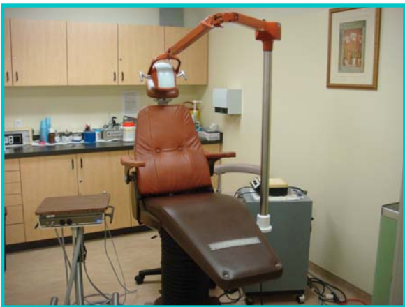
The Evangel Hall Mission Clinic is a necessary and free source of medical and dental care for homeless and at-risk individuals.

Recognizing these needs we took action. With the help of our dedicated supporters and volunteers, we have treated hundreds of patients who were in urgent need of free health and dental services.